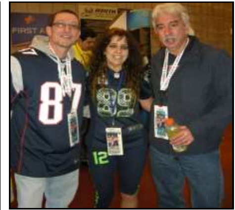
SOME OF THE PEOPLE WHO RECOGNIZED THE TWINS FROM PREVIOUS SIGHTINGS. THESE PATRIOT FANS (FAR RIGHT) ONLY FOUND OUT THE MORNING OF THE GAME THAT THEIR TICKETS BOOKED THROUGH A BIG-NAMED RESELLER HAD APPEARED.

"They will love you guys," the overly-enthusiastic — but incredibly kind — elderly volunteer said. "They'll eat you up."