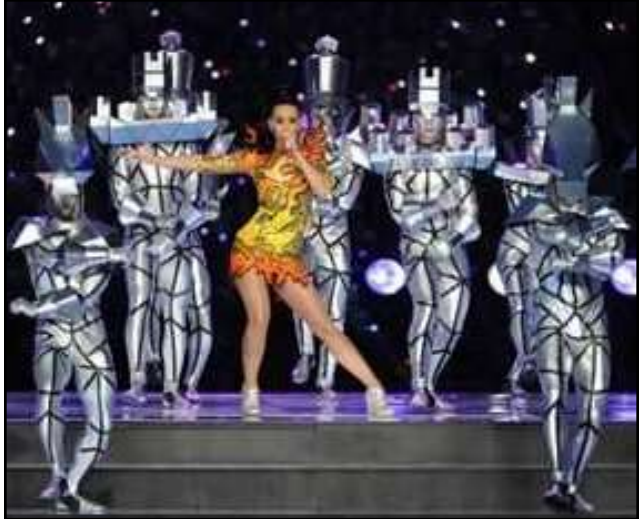
HALFTIME AT SUPER BOWL XLIX—KATY PERRY ROARING INTO THE STADIUM AND DANCING WITH DARK HORSES.

dimensions of each player, each fan, every sign or figure gracing the stadium — the sights, the sounds, the corn-flake smell of American beer and the sweet oil and onion stench of bloated hotdogs, providing a multidimensional experience for everyone being treated to a bleacher eye's view.