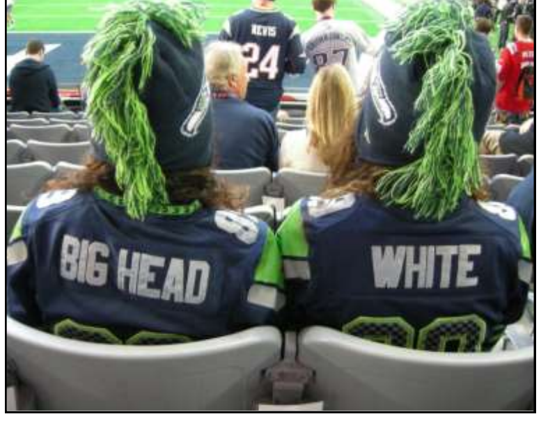
BACK IN THE SADDLE AGAIN. SUPER BOWL XLIX WITH HAWKS' EYE VIEW.

All it would take would be another easy NFC Conference Championship for the Seahawks — that is, two goal line stances, successful fake field goal touchdown, two TDs in waning minutes, onside kick recovery, two-point conversion, winning the coin toss, marching down the field for an overtime victory. Easy schmeasy.